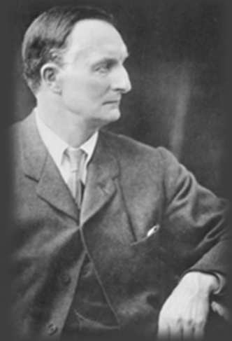
Sir Edward Grey