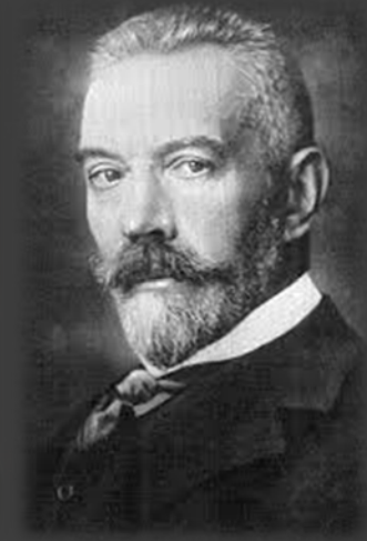
Theobald von Bethmann Hollweg