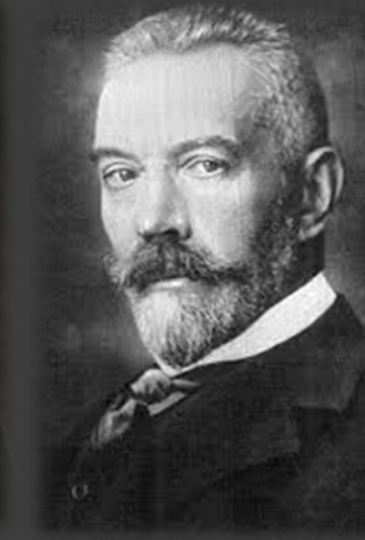
Theobald von Bethmann Hollweg